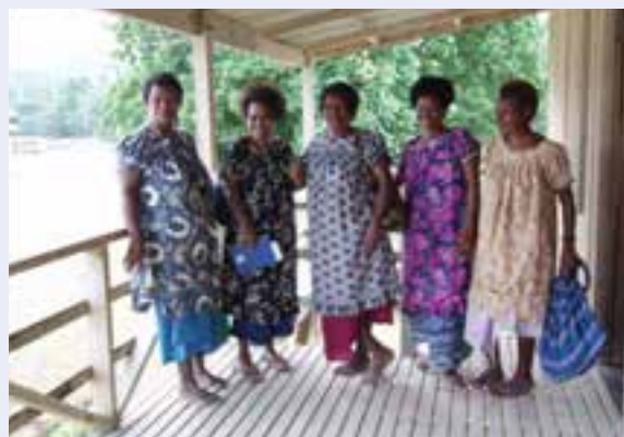
The leaders of the Lihir Mining Women Association at the Women Resource Center

The mining companies found that development outcomes from community investment programs could be improved