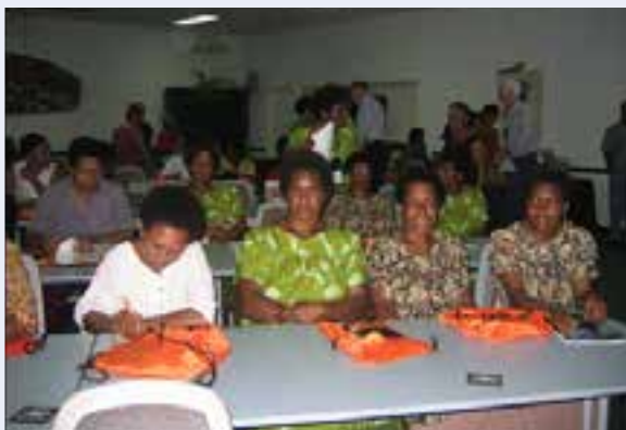
Cross-section of women attend the Women in Mining Conference.