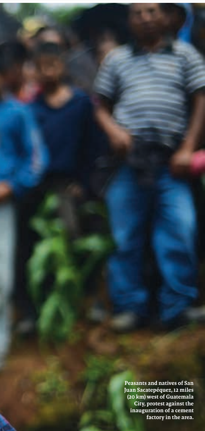
Peasants and natives of San Juan Sacatepéquez, 12 miles (20 km) west of Guatemala City, protest against the inauguration of a cement factory in the area.