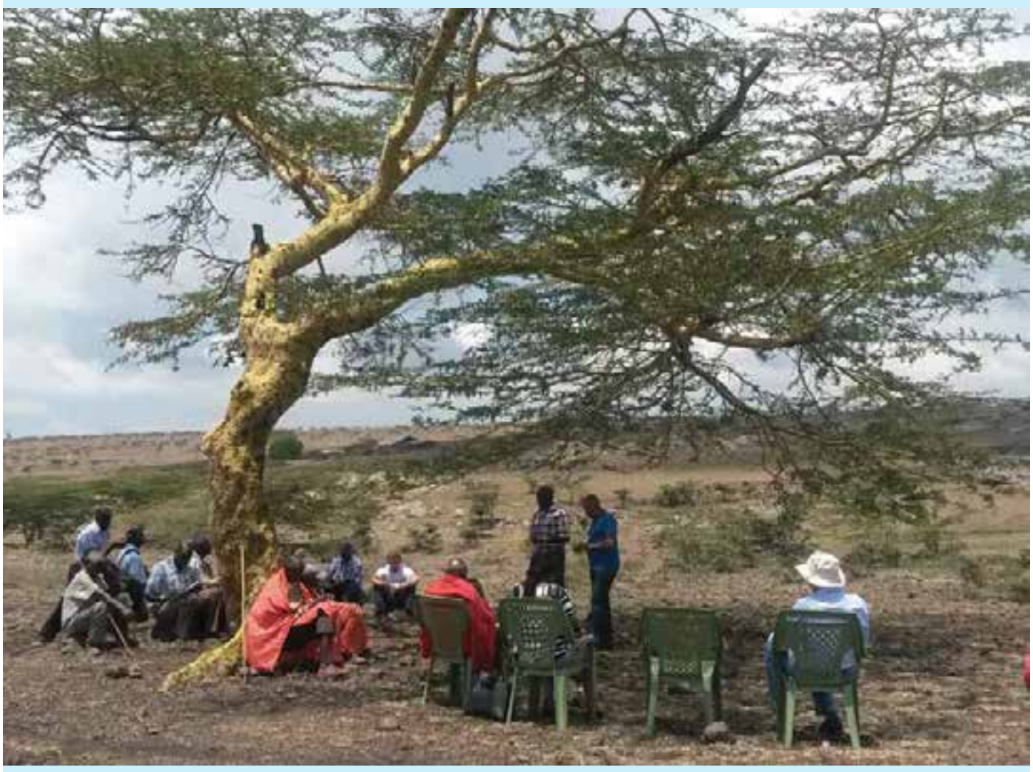
Meeting community stakeholders in Kenya.

The project also committed to providing interim funds for selected priority and 'quick win' projects that can be implemented in the short term, until the community trust is operational. These interim funds will be repaid from the trust once revenue (in the form of cash distributions) starts flowing into the trust.