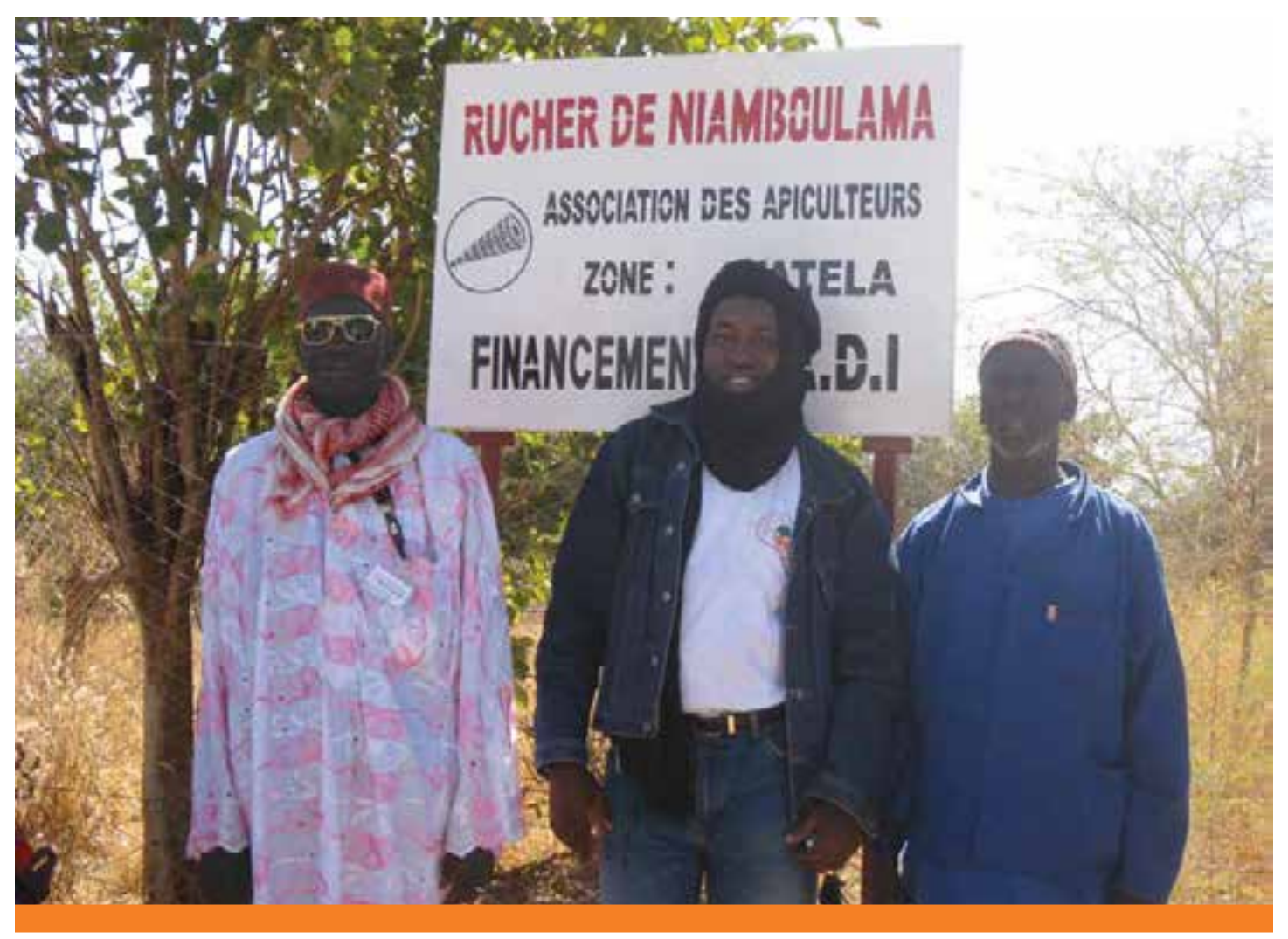
Association of beekeepers. Project sponsored by Integrated Development Action Plan (IDAP), Mali.