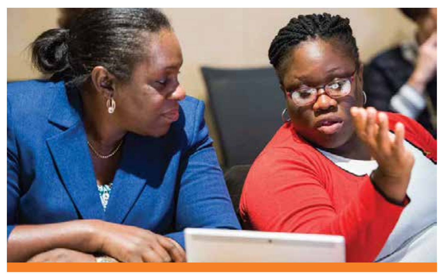
Corporate Governance training.

The stakeholder analysis described earlier should help companies understand how their stakeholders expect to participate in the foundation's governance structure. These expectations need to be balanced against a company's requirements for control, and should inform the proposed governance approach.