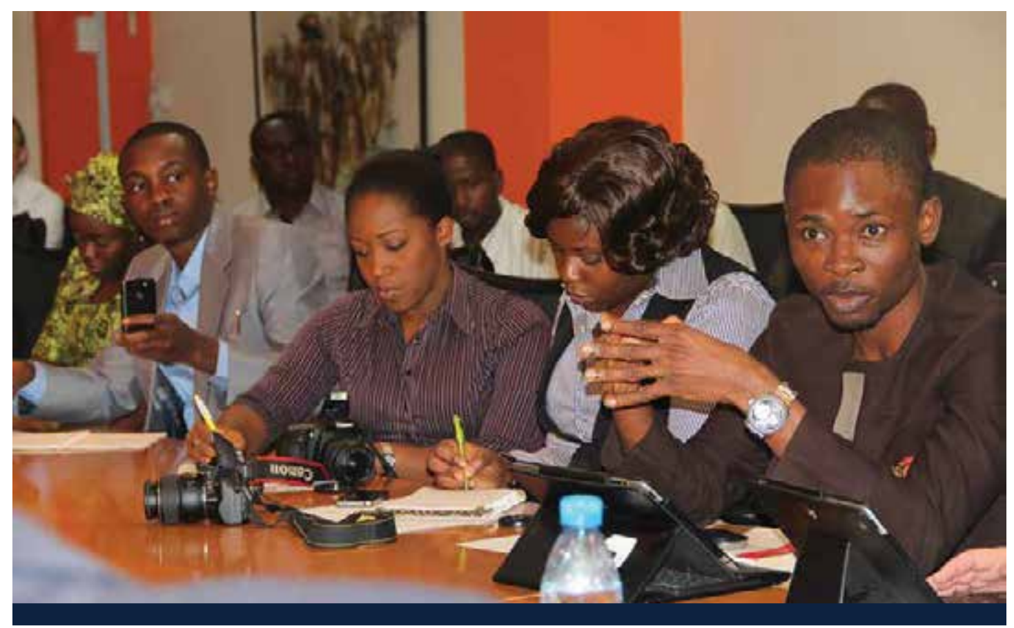
Youth forum breakfast in Nigeria.