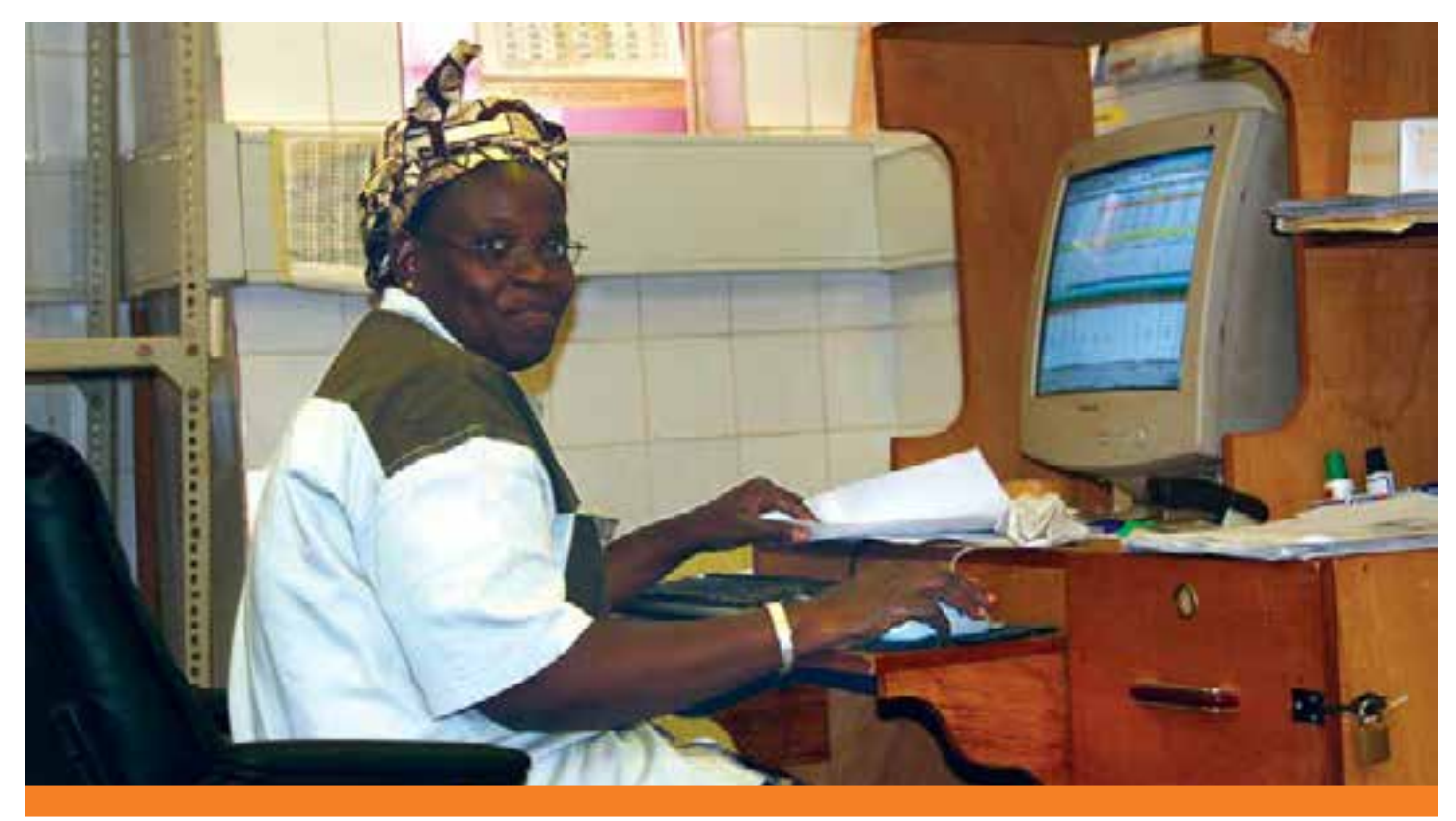
Local staff are being trained to capture and enter data at Sadiola gold mine in Mali.

As noted in the Rio Tinto Guidance on Community Trusts, Funds and Foundations (2011) "staff remuneration should reflect the professional