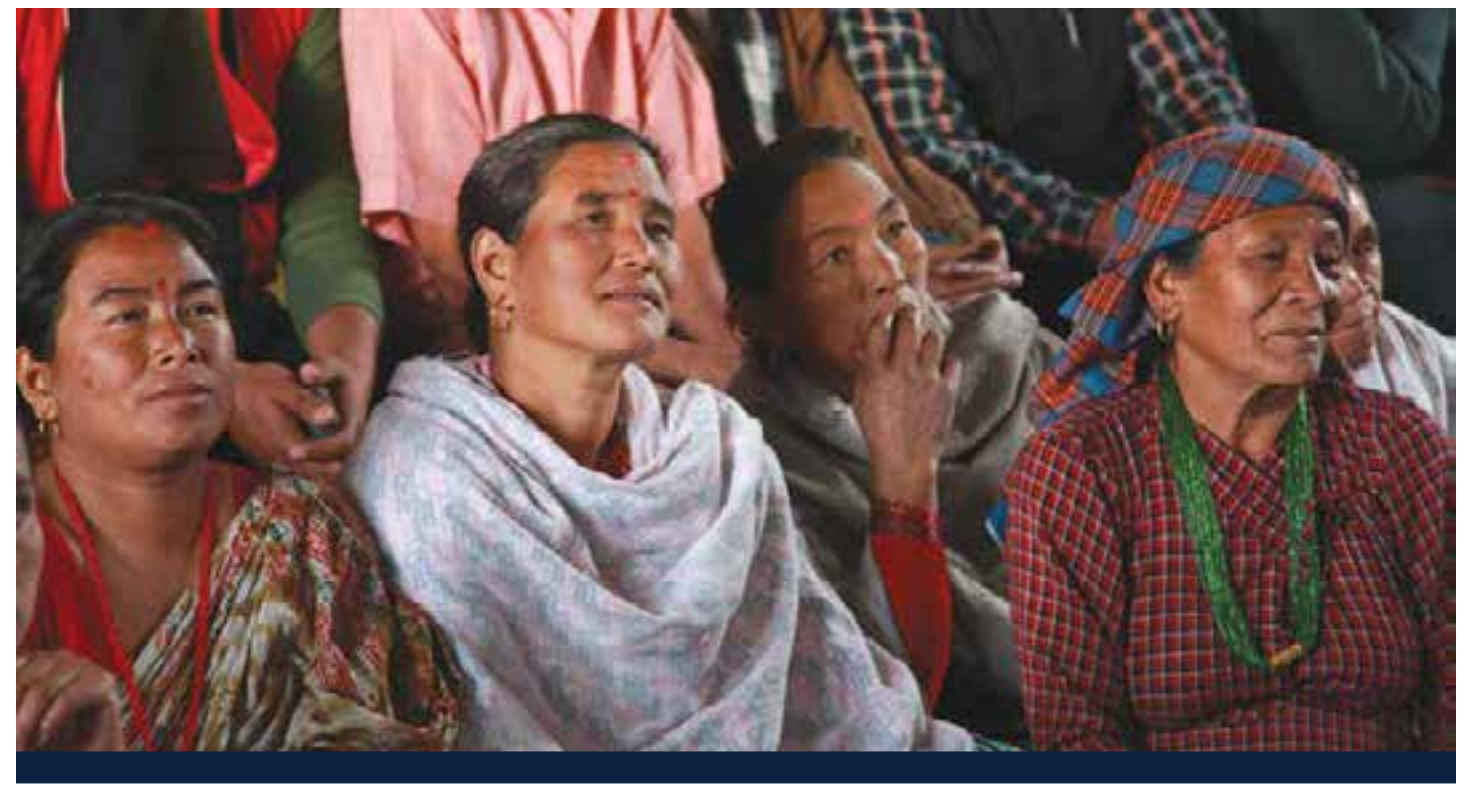
Community at a discussion of water supply and sanitation in Nepal.

Engagement with stakeholders to understand appropriateness of a foundation as a mechanism for delivering benefits should ideally be linked with a company's CI strategy. If a company does not have a CI strategy or its CI strategy is out of date, a separate stakeholder engagement process may be needed to develop such a strategy.