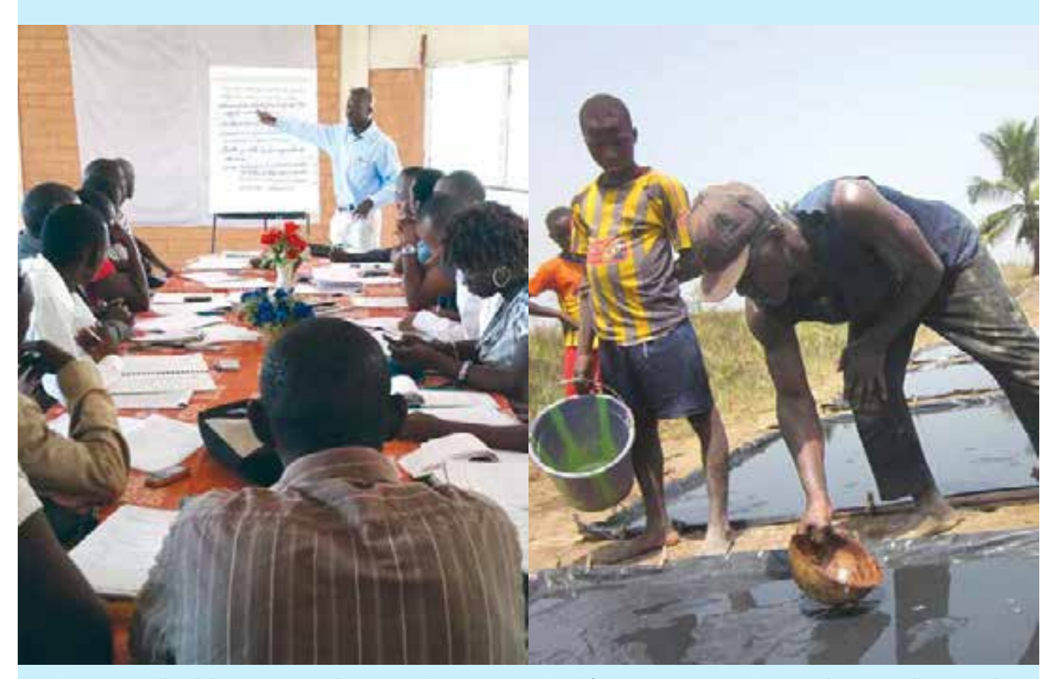
Youth entrepreneurship training programme. Project sponsored by Fondation Rio Tinto (Mamou, Guinea).